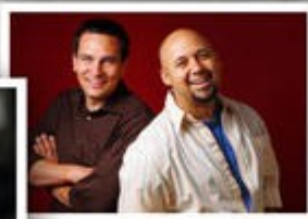
THE SKIT GUYS